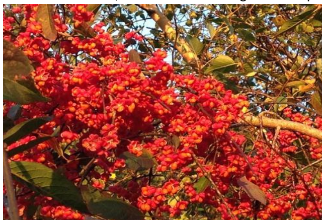
Impressive Spindle Fruits glowing in our garden this year.

Members from the closed Coleby Gardeners' Club are invited to join Welbourn Gardening Club. Next is a talk on Pests and Diseases, 10 th Nov in the Village Hall at 7pm.